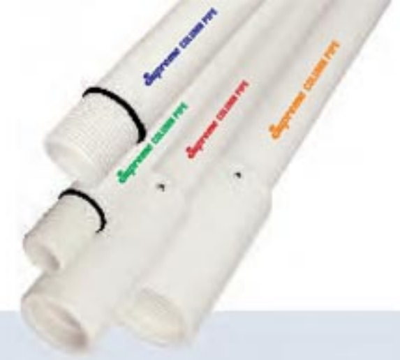
Dimension details of column pipes for submersible pumps